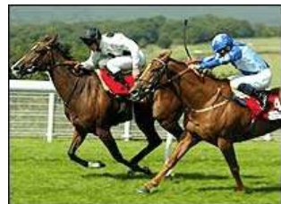
Soviet Song