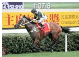
Silent Witness

Top Hong Kong sprinter Silent Witness (Aus) (El Moxie) stepped into the record books yesterday with his 1 3/4-length tally in the G1 Chairman's Sprint Prize at Sha Tin. With the victory over longshot Tiber (Ire) (Titus Livius {Ire}), the unbeaten gelding equaled the 16-race winning skeins Ribot, Citation and Cigar. "We knew he had the ability to win, but you never know what can happen in racing," said an emotional