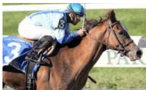
Park Avenue Ball