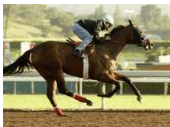
Sweet Catomine