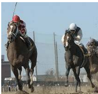
Forest Danger (red cap) tops Medallist Adam Coglianes

In a performance reminiscent of Strong Hope's four-year-old comeback, Forest Danger set a Gulfstream track record when he blazed through a 6 1/2-furlong allowance in 1:14 2/5 on Valentine's Day, earning a 118 Beyer. Bettors took notice of that effort and sent Forest Danger off as the 4-5 favorite despite the presence of graded winners Primary Suspect (Hennessy), Mass Media (Touch Gold), Medallist, and Don Six. The speedy bay settled into an easy rhythm under Rafael Bejarano and raced some five lengths off Don Six