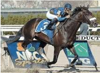
Bellamy Road