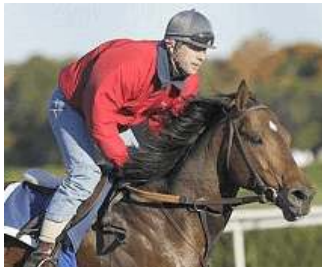
Ghostzapper in 2004

GHOSTZAPPER ON HOLD Ailing Horse of the Year Ghostzapper (Awesome Again) may return to training as early as Monday, according to Daily Racing Form .