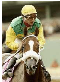
Consolidator

GII San Felipe S. winner Consolidator (Storm Cat) put in a sharp workout at Churchill Downs yesterday morning, going five furlongs in :59.60. The chestnut goes next in Saturday's GI Toyota Blue Grass S. "We didn't want a lot out of the work because we're right on top of this thing," trainer D. Wayne Lukas said. "We had an awfully good work last week, so this one was just a matter of tuning it a little bit. I'm really comfortable with him. I think he gets over this racetrack well and hopefully he'll carry his form from last year at Keeneland back to the Blue Grass."