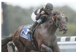
Ghostzapper