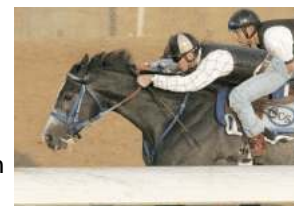
Rockport Harbor