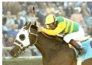
Going Wild

It would seem that Going Wild (Golden Missile), also conditioned by Wayne Lukas, would be off the Derby trail after finishing last in Saturday's GI Wood Memorial, but the trainer said yesterday that a run for the roses is still possible. "[His race in the Wood] was too bad to believe," Lukas said. "He didn't warm up with any enthusiasm. He was listless in the post parade and everything, so I'm just going to throw it out. I know he's a better horse than that...he's a very, very good horse. It didn't turn out well [Saturday], but it's four weeks to the Derby and I think it's fixable."