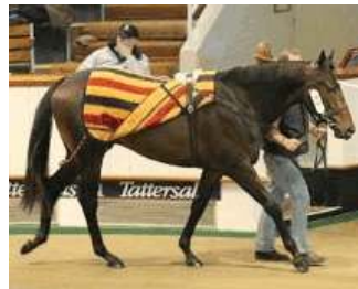
'04 Tattersalls Sale Topper 500,000gns colt by Fusaichi Pegasus Tattersalls.com