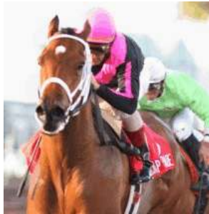
Madcap Escapade