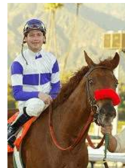
Sharp Lisa