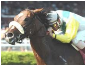
Artie Schiller

Artie Schiller (El Prado {Ire}), one of the top sophomore turfers last year, makes his long awaited seasonal debut in today's GII Maker's Mark Mile S. at Keeneland. The bay rattled off three straight victories last spring, including the GIII Hill Prince S. at Belmont, but had that streak come to an end when second to champion turf horse Kitten's Joy in the GIII Virginia Derby. He quickly got back on track after that loss, notching wins in the GII Hall of