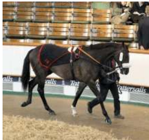
Lot 147 tattersalls.com

The two-day Tattersalls' Breeze-Up Sale at Newmarket concluded yesterday with solid across-the-board gains, including new records for gross, average and median. Sheikh Rashid Al Maktoum purchased the event's top lot last night, paying 270,000gns for a Red Ransom half brother to Grade II winner Talloires (Tremolino). The colt, selling as Lot 147, had been unsold for $110,000 at Keeneland September and was consigned by Jamie Railton yesterday. A