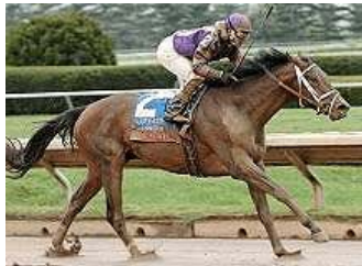
Coin Silver

Trainer Todd Pletcher may have found himself a third Kentucky Derby candidate when Coin Silver (Anees)