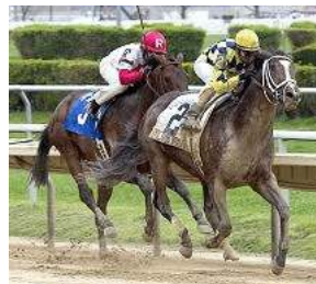
Pollard's Vision Four Footed Fotos

Pollard's Vision (Carson City), who bankrolled over