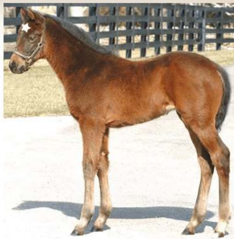
Filly out of SHE'S FINE -MULTIPLE STAKES PRODUCER Bred by GRAPESTOCK LLC