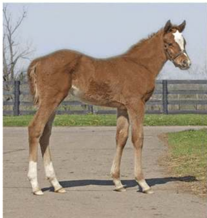
Filly out of AMERIFLORA - MULTIPLE GRADE I PRODUCER Owned by PHILLIPS RACING PARTNERSHIP