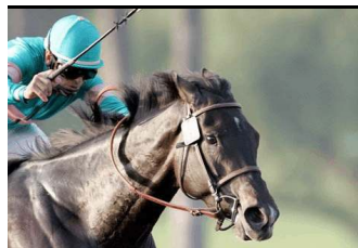
TARLOW at Santa Anita

Click for the brisnet.com chart or video replay .