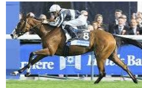
Divine Proportions

There will be several Classic trials at Longchamp this