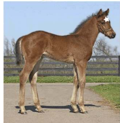
Colt out of Champion SOARING SOFTLY - Owned by PHILLIPS RACING PARTNERSHIP