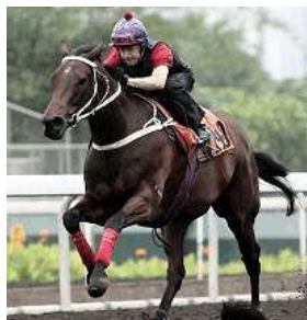
Silent Witness

WITNESS GOES FOR MORE HISTORY Silent Witness (Aus) (El Moxie) bids for his 17th win in as many career starts when he goes postward in today's