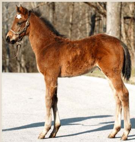
Colt out of ESPIRIT D' ESCALIER -MULTIPLE STAKES PRODUCER Bred by C.H.O LLC.