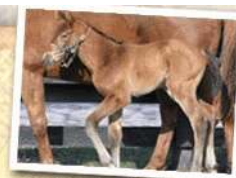
Empire Maker - Secret Status foal

Among the incredible mares bred in 2004 to Classic Winner Empire Maker are 4 Kentucky Oaks (GI) winners: Bird Town, Keeper Hill, Secret Status and Flute