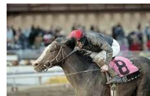
Survivalist