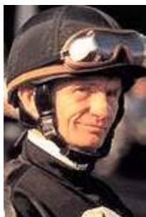
Pat Day Horsephotos