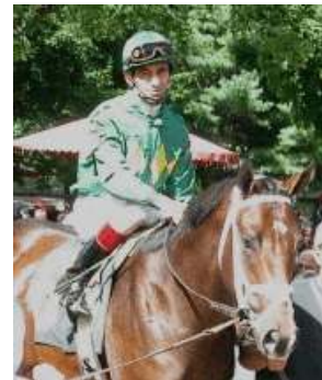
Proud Accolade