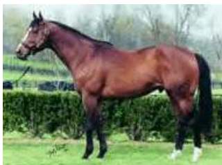
$10,000 Live Foal

A # will distinguish first-time stakes-winners, a @ will indicate first-time graded stakes-winners, a ▲ will denote a first-time Grade/Group 1 winner