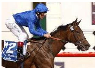
Satin Kiss