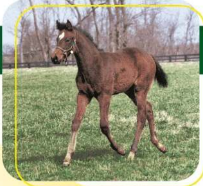
UNBRIDLED LASSIE f. 1/25

Click here to see and read about the first foals from the 2003 Horse of the Year.