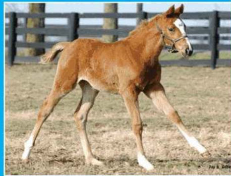
Filly ex IMELDA'S SHOES