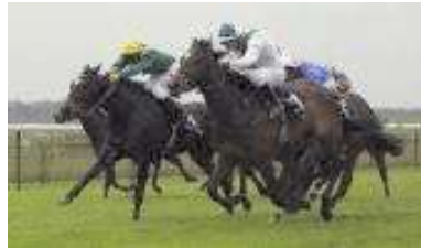
Karen's Caper bests Cape Columbine provide some light for in the Nell Gwyn

After several high-profile withdrawals, today's G1 1000 Guineas at Newmarket has the most open feel in recent years, with Stonerside Stables' Karen's Caper (War Chant) just leading the betting on this cavalry charge. She came into the G3 Nell Gwyn S. with only a Lingfield polytrack success to her name, but came out the other side a legitimate Classic contender by beating Cape Columbine (GB) (Diktat {GB}) by 3/4 of a length at this venue Apr. 13. In a spring blighted by cold, wet weather, she may yet provide some light for trainer John Gosden, successful with Lahan (GB) in 2000. "It's not been a great spring for fillies and the Guineas comes a week early this year," he said. "A week at this time of year can make a big difference, but she won nicely last time and has improved in her coat. Although it's an open race I hope she can do it again." 1000 Guineas cont. p2-3