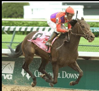
DON'T GET MAD