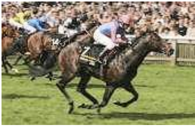
Footstepsinthesand