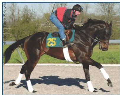
$335,000 Keeneland 2YO