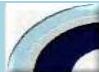
Also standing DREAM WELL Dual Derby winner and halfbrother to champion Sulamani

Full brother to MACHIAVELLIAN and COUP DE GENIE (grandam of BAGO ) Sire of STELLA ROSSA , comfortable 2-length winner of Prix l'Essor at Marseille over 950m, 29th April 2005 Haras de Fresnay-le-Buffard, 61210 Neuvy-au-Houlme, France Tel: (33) 02 33 12 14 00 Fax: (33) 02 33 12 14 15 www.harasfresnay.com Email: fresnayagricole@harasfresnay.com