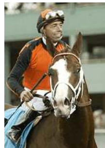
Buzzards Bay Benoit