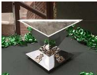
Triple Crown trophy

Unveiling a change in its marketing strategy, Visa USA yesterday announced that it will not renew its 10-year sponsorship of the Visa Triple Crown. Instead, the company has signed a five-year deal with Churchill Downs Incorporated to sponsor the GI Kentucky Derby. The agreement goes into effect in 2006. "We've had an unbelievably successful partnership with the Visa Triple Crown, but we must always work to keep our approach fresh and relevant to our