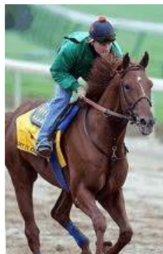
Sort It Out