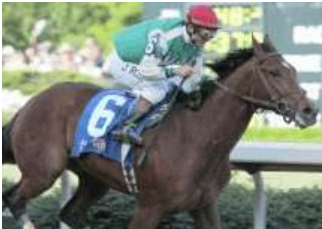
Afleet Alex