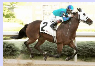
4/14-1st Count Fleet Sprint H.-G3