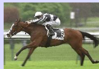
4/24-1st Prix de la Grotte-G3