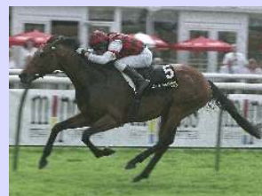
5/1 - 1st Ultimatepoker.com Jockey Club S.-G2