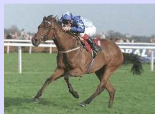
5/1 - 1st VCbet Dahlia S.-G3