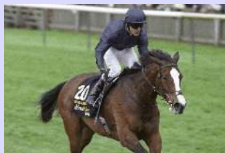
5/1 - 1st Ultimatepoker.com 1000 Guineas-G1