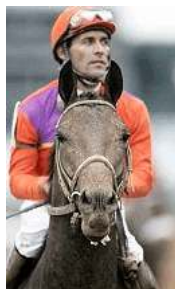
Don't Get Mad