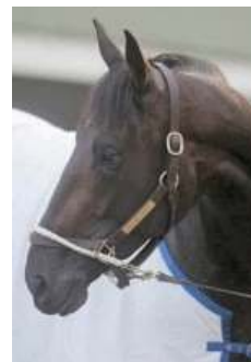
Bellamy Road

Despite all five of his Derby runners missing the board, trainer Nick Zito said yesterday that each horse came out of the race fine and would, for the time being, remain at Churchill. "These horses look tremendous," said Zito. "They look better now than they went in the race. We will keep them here and let them rest. I don't want to ship them anywhere right now. We will definitely go to Baltimore [for the Preakness] with somebody." Zito's best hope for a Derby win, the 5-2 post-time favorite Bellamy Road (Concerto), tired a furlong out after attending a hot pace and came home seventh, the best finish of Zito's runners and three spots ahead of High Fly (Atticus), the 7-1 fourth chance. "At the top of the stretch, we were getting excited," admitted Zito, "because those two horses [Bellamy Road and High Fly] were making a winning run. But when that big burst of horses came around the turn, I couldn't believe that none of them were our other horses. What could you do? That's sports." Zito's Andromeda's Hero (Fusaichi Pegasus) ran eighth, with Noble Causeway (Giant's Causeway) and Sun King (Charismatic) in 14th and 15th, respectively.