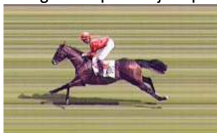
Hurricane Run

Gestut Ammerland's Hurricane Run (Ire) (Montjeu {Ire}) produced a late show of dramatic acceleration to annihilate his rivals in yesterday's G2 Prix Hocquart at Longchamp and jump to the head of France's sophomore middle-distance division. His future looked bright when winning a debutantes race at this track in October and a course-and-distance conditions event back here last time Apr. 15, but the Parisians could not see beyond the 2-5 pick Ruwi