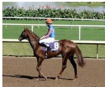
Mona Lisa at Lone Star Park

Three-year-old fillies take centerstage as York's May Festival kicks off this afternoon with the running of the G3 Tattersalls Musidora S. Trainer Aidan O'Brien continues his fact-finding mission across the Irish Sea with Mona Lisa (GB) (Giant's Causeway) and she bids to book her ticket to the G1 Epsom Oaks June 3. Despite still being a maiden in four career starts, she was beaten a length by Playful Act (Ire) when an unlucky fourth in the G1 Fillies' Mile at Ascot in September before finding the competition