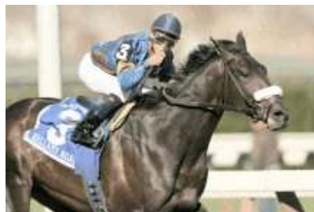
Bellamy Road