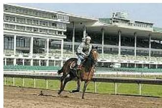
Monmouth Park

Monmouth Park, located in Oceanport, New Jersey, is set to begin its 60th season of racing this Saturday.