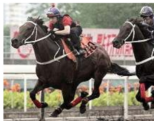
Silent Witness www.hkjc.com

WITNESS WORKS FOR MILE TEST Silent Witness (Aus) (El Moxie), bidding to take his lifetime record to a