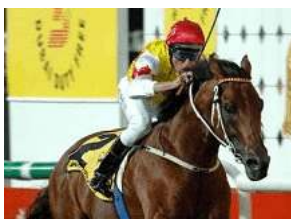
Elvstroem

he explained. "I think he's a better horse this year than last, but if the right Rakti turns up he's the winner for sure." Further spice is added by the presence of the G1 Dubai Duty Free winner Elvstroem (Aus) (Danehill), who seeks to bury a disappointing