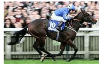
Shamardal