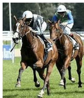
Divine Proportions