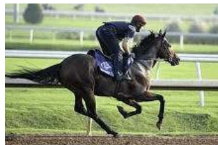
Antonius Pius