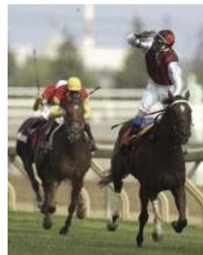
Wando