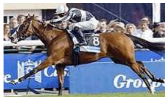
Divine Proportions

LIVING UP TO HER NAME The unbeaten Divine Proportions (Kingmambo) looked as good as ever when