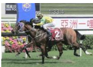
Bullish Luck HKJC

The 17-race winning streak of Silent Witness (Aus) (El Moxie) came to a halt yesterday afternoon at Sha