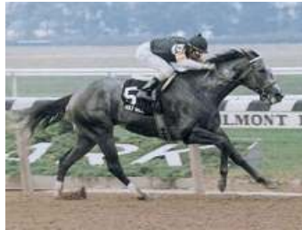
Holy Bull www.darleystallions.com

Though the breeding season is winding down, Giacomo's victory spurred a number of calls from owners looking to get their mares to Holy Bull. The stallion had a book of 88 going into the Derby. By Tuesday, that number had quickly eclipsed the three-figure mark.