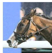
Divine Proportions

If she was human, she would be in the supermodel bracket, and the Niarchos Family's Divine Proportions