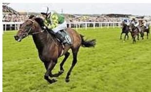
Rakti