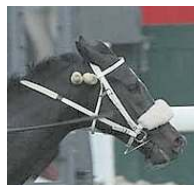
Helios Quercus

Godolphin's Shamardal (Giant's Causeway) will be hoping to get back on track in the G1 Gainsborough Poule d'Essai des Poulains this afternoon at Longchamp, but the bay will have to overcome 14 rivals, including French star Helios Quercus (Fr) (Diableneyev). The brown colt enjoyed a successful campaign in 2004, capturing six of seven starts, including the G1 Criterium International at Saint-Cloud in his final outing last year. Cont. p4-5