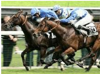
Shamardal

Godolphin had made a quiet start to the term, but Shamardal (Giant's Causeway) returned the smile to the