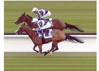
Divine Proportions