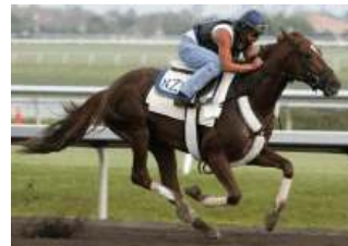
Noble Causeway