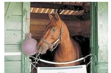
Funny Cide