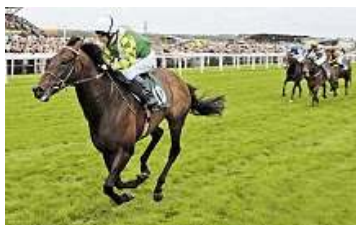
Rakti

As I have previously written about Shamardal, Divine Proportions and Motivator, I am going to seize the