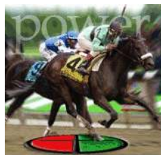
BIRDSTONE defeated SMARTY JONES in the Belmont S.-G1