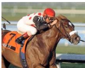
High Fly