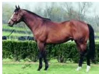
$10,000 Live Foal