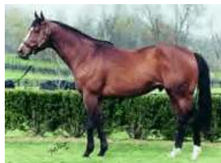
$10,000 Live Foal

A poor start and the sticky surface spelled doom for the 3-2 chalk Maddalena (Good and Tough), but second choice Burnish skipped over the slop for her first graded stakes victory. The Arthur Hancock homebred broke her maiden in her second start at Saratoga Sept. 5 and added an allowance win at Keeneland the following month before finishing up her juvenile season with a fifth in the Pocahontas S. at Churchill Nov. 6. She didn't face the starter again until Apr. 9, finishing third in a Keeneland allowance, but rebounded with a 10-length triumph in a similar contest on a wet day Apr. 23. Allowed to settle into stride by Rafael Bejarano, the bay bided her time in fifth, rallied up the center of the track and hit the front late. "I was glad to see the muddy track because she ran so well on a wet track at Keeneland last out," said winning trainer Nick Zito. "She ran huge today." Video, sponsored by Taylor Made. Click for the brisnet.com chart .