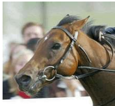
Oratorio Rrance Galop