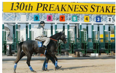
Giacomo at Pimlico

The last three Kentucky Derby winners--Smarty Jones (2004), Funny Cide (2003) and War Emblem (2002)--all added a victory in the GI Preakness S. on their way to earning Eclipse Awards as the nation's top three-year-old.