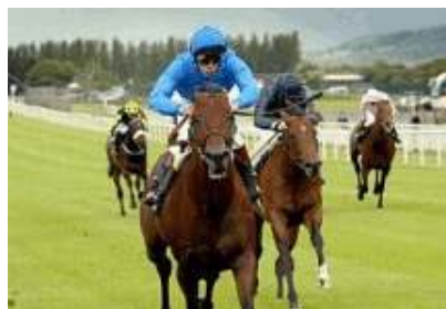
Dubawi