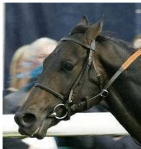
Bago

Bago makes his first foray to these shores after a string of stellar performances in his native country, highlighted by his victory in the G1 Prix de l'Arc de Triomphe at Longchamp in October. He looks ready to add to his laurels here, based on his winning return in testing conditions in the G1 Prix Ganay at Longchamp Apr. 24. He meets stern opposition in Azamour , who proved adaptable last term when winning the G1 St James's Palace S. over a mile at Royal Ascot in June and G1 Irish