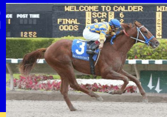
With a City

With a City became his sire's first winner with his 6 1/4 length debut victory at Calder yesterday!