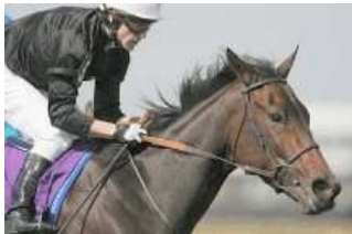
Ouiji Board