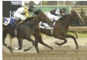
Honolua Storm (rail)