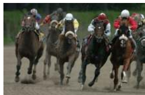
The Turn For Home