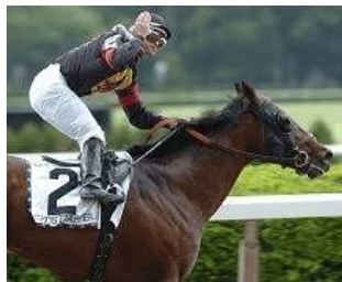
Ghostzapper

Kendall-Jackson principal Jess Jackson has purchased a part interest in 2004 Horse of the Year Ghostzapper (Awesome Again) from owner and breeder Frank