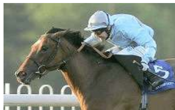
New Morning