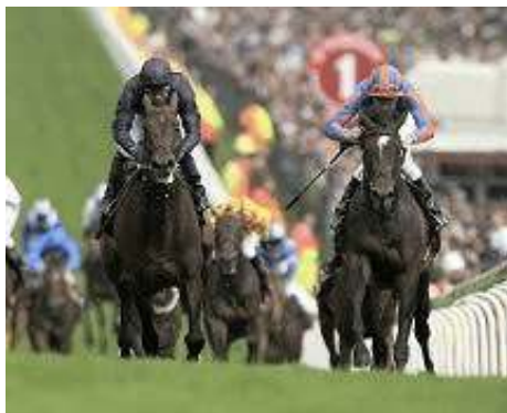
Up the Rise at Epsom