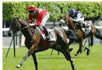
Hurricane Run

Gestut Ammerland's unbeaten Hurricane Run (Ire) (Montjeu {Ire}) will face an overflow field of 16 rivals as