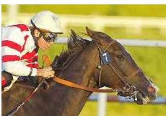
Splendid Blended