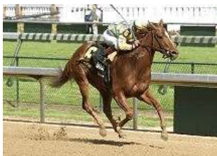
Seek a Star Four Footed Fotos

All post times in the TDN are listed as local time.