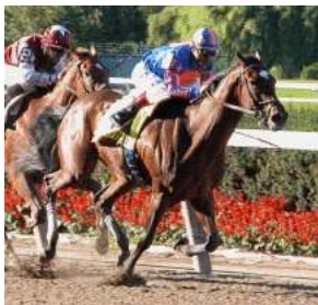
Sense of Style