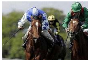
Fracas (left)