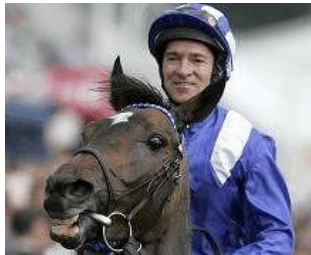
Eswarah

Sheikh Hamdan bin Rashid al Maktoum's Eswarah (GB) (Unfuwain) defied inexperience and a tough rival in Something Exciting (GB) (Halling) to record a half-length success in the G1 Vodafone Oaks at Epsom yesterday.