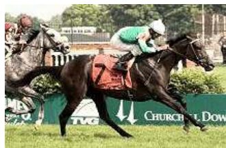
Four Footed Fotos

Some horses love carrots. Some love peppermints. Delta Princess? She loves a mile and a sixteenth. The