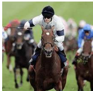
Motivator