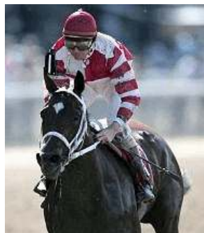
Round Pond

Round Pond didn't make it to the races at two and was a troubled third in her career opener at Oaklawn Feb. 13, but they haven't been able to beat her since.