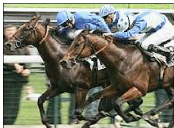
Shamardal takes French 2000