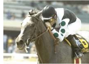
Three Degrees