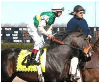
Medallist

Grade II winner Medallist (Touch Gold--Santaria, by Star de Naskra), who has been retired from racing because of a sesamoid fracture, will take up stud duty at