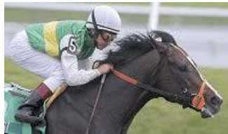
Winning the Deputy Minister