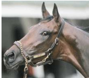
Sis City