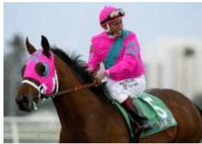
Saint Liam