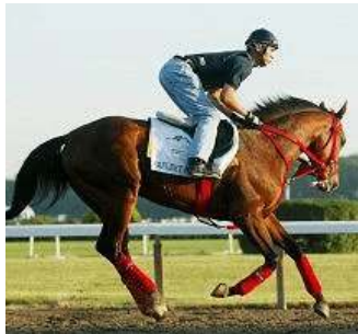
Afleet Alex

For the 28th consecutive year there will be no Triple Crown winner, but by no means does that diminish the interest in or the importance of Saturday's Grade I Belmont S. Afleet Alex (Northern Afleet), who turned in a performance for the ages in winning the GI Preakness S. May 21, and GI Kentucky Derby hero Giacomo (Holy Bull) have three-year-old supremacy to play for in their third head-to-head meeting, while Andromeda's Hero (Fusaichi Pegasus), eighth in the Derby, and eight newcomers will try to establish their position among the leaders of the sophomore division. "It's more than Giacomo versus