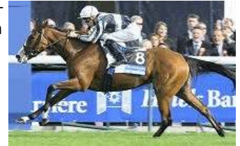
Divine Proportions France Galop