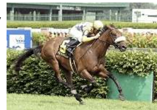
Sand Springs

Somewhat unusually, this field features several runners who do their best work on the front end, including the graded-stakes winning duo of Sand Springs and Changing World . Sand Springs led every step of the GIII Honey Fox H. at Gulfstream Mar. 13 and settled for second in the GIII Distaff Turf Mile at Churchill on Derby Day. Changing World, the wire-to-wire winner of the GIII Violet H. last year, got swallowed up late when fifth--beaten 2 1/4 lengths--in the GIII Gallorette H. at Pimlico three weeks ago. Asti showed good form in France last year, finishing a neck second in the G1 Prix Saint-Alary and a close fourth in the G2 Prix Daniel Wildenstein. The Irish-bred has come up short in three starts on these shores, most recently running third with first-time Lasix in the Voodoo Dancer S. over course and distance May 12.