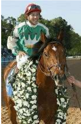
Afleet Alex

The 137th running of the GI Belmont S. has been billed as the rubber match between GI Kentucky Derby winner Giacomo (Holy Bull) and GI Preakness hero Afleet Alex (Northern Afleet). But if Afleet Alex runs back to his race in the second leg of the Triple Crown, it will be no contest. The bay colt may have bounced a bit off his eight-length romp in the GI Arkansas Derby, and ended up third on the first Saturday in May, but he was on top of his game for the Preakness, turning that one-length defeat into a 9 3/4-length drubbing of the Derby victor despite nearly falling at the top of the stretch. Now it will be up to