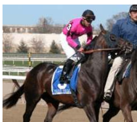
Mass Media

Mass Media , unbeaten in two starts over this surface, beat Smokume in the Fly So Free S. Sept. 12. The dark bay earned a 115 Beyer Speed Figure for his win in the GIII Sport Page H. on Halloween, but has had trouble finding the winner's circle in four subsequent outings. A half-length second in the GII San Fernando Breeders' Cup S. at two turns Jan. 15, he failed to menace in a pair of starts over seven furlongs, running sixth in the GII San Carlos H. Feb. 26 and fifth in the GI Carter H. Apr. 9. He will race without blinkers this afternoon for the first time in 11 career starts. Smokume has been out just once since the Fly So Free S., emerging victorious from Monmouth's Decathlon H. May 14.