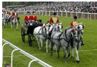
Royal Procession www.royalascot.co.uk

Royal Ascot has existed in some form since 1711, but it was only at the end of the 18 th century and the start of the next that the meeting took shape. With the introduction of the Gold Cup in 1807 started the evolution of the dress code, which remains vital to this day,