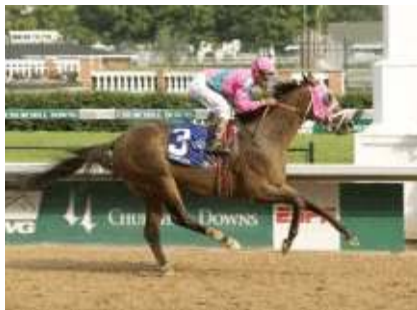
Four Footed Photos

With the retirement of Ghostzapper, Saint Liam was looking to demonstrate his worthiness as a potential