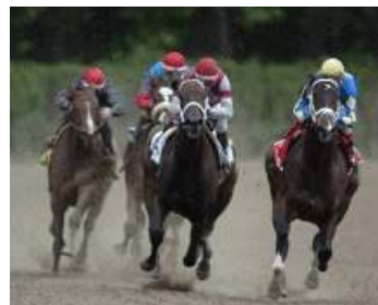
On to victory for Ashado (inside)

at Saratoga. Shipped to Pennsylvania to face much softer, Ashado dominated the GII Cotillion H. field Oct. 2 and locked up championship honors with her 1 1/4-length success in the GI Breeders' Cup Distaff. Away for five months thereafter, the dark bay was a surprising fifth in the GI Apple Blossom H. at Oaklawn Apr. 9 prior to her Pimlico defeat,