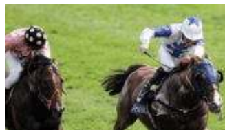
Cape of Good Hope (right) bests Galeota