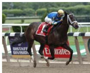
Ashado

The rumors of her demise have been greatly exaggerated. Following her defeat in the GIII Pimlico Breeders' Cup Distaff May 20, some were ready to declare the career of Eclipse Award winner Ashado (Saint Ballado) over, but the filly silenced those naysayers yesterday, leading from flagfall to finish in the GI Ogden Phipps H. at Belmont Park. In scoring her first victory of her 2005 campaign, the reigning champion was away a beat slowly, but recovered to set a soft pace for this level and cruised home an easy winner. But the race did not unfold exactly as expected. "I don't think being on the lead is her preferred running style, but anytime you can get the first quarter in :24, you have to take that," commented winning trainer Todd Pletcher. "I think she showed today what she's all about." Cont. p2