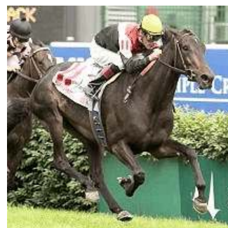
Four Footed Fotos

Rich in Spirit broke from the far outside in the eight-horse field, but was able to overcome the wide draw to