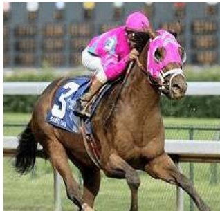
Saint Liam