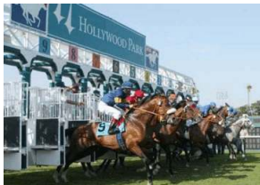
Racing at Hollywood

With a bid of about $275 million, the owner of Bay Meadows has emerged as a leading candidate to acquire Hollywood Park, according to the Los Angeles Business Journal . The publication, which cites 'numerous sources,' said that Stockbridge Capital Partners, through its Bay Meadows Land Co. unit, came storming into contention for the 240-acre property with a late bid that surprised Inglewood city officials and rival developers alike. The $275-million bid is reported to be some 10 percent higher than the next closest bid. Stockbridge has also agreed to hire Hollywood's current owner, Churchill Downs Inc., to manage the track for three years while Stockbridge goes through the entitlement process. Horse racing would continue during that period.