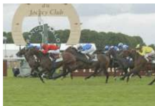
Hurricane Run (outside)