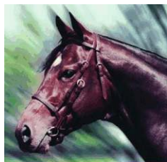
Officer-G1 Winner at 2