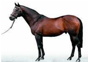
Polish Precedent

Darley stallion Polish Precedent (Danzig--Past Example, by Buckpasser) died after suffering complications from colic surgery Tuesday night. Named the champion miler in France in 1989 for owner Sheikh Mohammed and trainer Andre Fabre, the bay won seven of his nine career starts, including the G1 Prix du Moulin de Longchamp and G1 Prix Jacques le Marois. He retired after his three-year-old season and stood his entire stud career at Dalham Hall Stud in Newmarket. The 19-year-old stallion sired 23 stakes