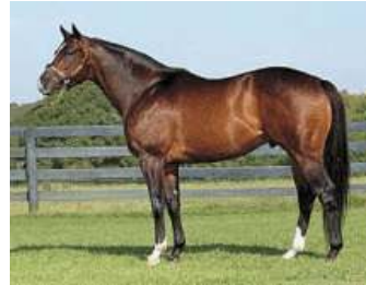
Valid Expectations www.lanesend.com