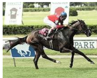
Melhor Ainda

An international field of 14 fillies has been extended invitations for the $750,000 G1 American Oaks, which will be contested at Hollywood Park July 3. The list includes Japanese Oaks winner Cesario (Jpn) (Special Week {Jpn}), as well as G2 Premio Regina Elena victress Silver Cup (Ire) (Almutawakel {GB}). Expected to spearhead the U.S. team is the unbeaten Melhor Ainda (Pulpit), along with GII Honeymoon Breeders' Cup H. heroine Three Degrees (Ire) (Singspiel {Ire}). Other invitees include Karen's Cap (War Chant) from England; the Irish-based pair of Luas Line (Ire) (Danehill) and Silk and Scarlet (GB) (Sadler's Wells); Honeymoon second and third Thatswhatimean (Belong to Me) and Isla Cozzene (Cozzene); Laurafina (Cozzene), runner-up to Melhor Ainda in the GIII Sands Point S.; G1 Hollywood Starlet winner Splendid Blended (Unbridled's Song); the Grade I-placed Memorette (Memo {Chi}); and Grat (A.P. Indy), a recent allowance winner at Churchill Downs.