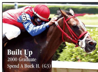
Built Up 2000 Graduate Spend A Buck H. (G3)

Castledale (Ire) (Peintre Celebre), 4f, :47.80, 7/29 El Roblar (War Chant), 5f, 1:02.20, 26/34 Southern Image (Halo's Image), 4f, :52.00, 28/29