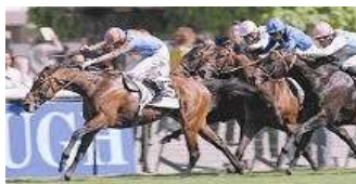
Antonius Pius at Longchamp