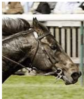
Footstepsinthesand