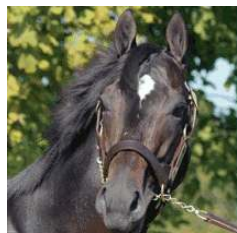
ORIENTATE Dominant Sprinter