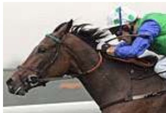
Playful Act