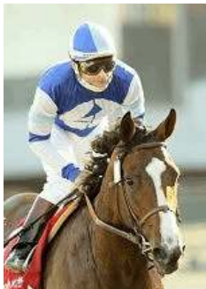
Whilly

Whilly utilized his front-running style to land the GII San Marcos H. Jan. 22 and held on bravely for second in the G1 Dubai Duty Free Mar. 26. He weakened to be fifth in his comeback, the G1 Shoemaker Breeders' Cup Mile May 30, but should come on for that run. King of Happiness , winner by a nose of the GIII Inglewood H. Apr. 30, settled for the runner-up spot in the Shoemaker, with Fast and Furious third. Qsar captured four of seven starts in his native Germany before taking his U.S. bow May 29 in a 1 3/16-mile optional claimer.