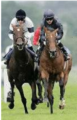
Oratorio (right)

He takes some stoking up, but when he gets going, Susan Magnier and Michael Tabor's Oratorio (Ire) (Danehill) can do some damage. He dealt a major blow to Motivator (GB) (Montjeu {Ire}) in yesterday's G1 Coral-Eclipse S. at Sandown, handing that rival his first-ever defeat. Last year's G1 Prix Jean-Luc Lagardere winner trailed in 25 lengths behind Motivator in the G1 Epsom Derby June 4, but showed a spark of revival in the interim, running third in the G1 St James's Palace S. at Royal Ascot at York June 14. "We don't know what really happened in the Derby, and every week for some reason he's just getting better and better," said trainer Aidan O'Brien. Coral-Eclipse S. cont. p2