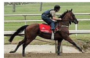
Sweet Firebird

Sunday, Hamburg, Germany, post time: 5:15 p.m. BMW 136TH DEUTSCHES DERBY-G1 , €505,000, 3yo, c/f, 1 1/2mT