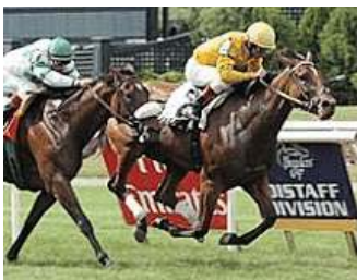
Wend

obstacles to maintain her perfect mark on the grass. After finishing unplaced on the dirt at Aqueduct Nov. 24, the Claiborne homebred captured her turf bow at Tampa Jan. 2 and added a pair of daylight allowance wins at Gulfstream over the winter. She aired in the Hollywood Wildcat BC H. at Calder Apr. 30, but hadn't