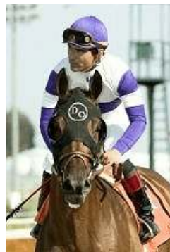
Andujar