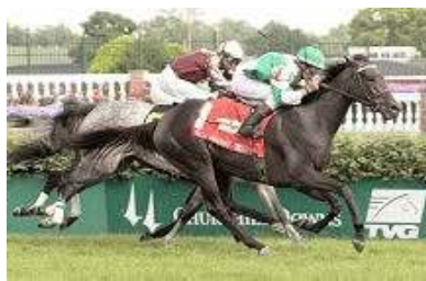
Delta Princess

Homebred Delta Princess seems to be getting better with age as the six-year-old came running late to snag a