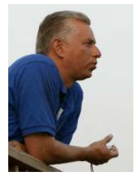
Todd Pletcher

given a 45-day suspension and fined $3,000 by the New York State Racing and Wagering Board for a drug positive at Saratoga last August, according to published reports. Pletcher's Tales of Glory, winner of the third race at Saratoga Aug. 14, was found to have Mepivacaine in his system from post-race samples, according to the NYSRWB ruling, and has been disqualified.