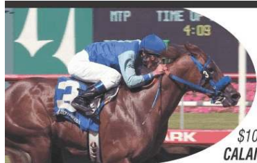
$100,000 Barretts 2yo CALAMITY JUNE