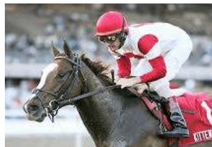
Kitten's Joy

Champion Kitten's Joy (El Prado {Ire}) makes his long-awaited return in the GI Firecracker Breeders' Cup