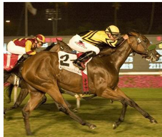
Mercedes Stables' SHE'S A JEWEL ( click here to view race video )