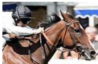
Soviet Song

Twelve months ago, Soviet Song (Ire) (Marju {Ire}) did the unthinkable in downing Attraction (GB) in the inaugural running of the Falmouth S. as a Group 1