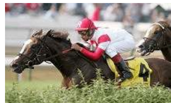
Kitten's Joy

He was making his first start since Breeders' Cup day, but champion Kitten's Joy (El Prado {Ire}) looked anything but rusty in the GII Firecracker Breeders' Cup H. at Churchill Downs yesterday, rocketing through a final quarter in a shade under :22 flat to win by a handy length. It was the first time the four-year-old had tried a distance as short as a mile on the