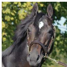
ORIENTATE Dominant Sprinter

Roman Ruler showed promise as a juvenile, winning the GII Best Pal S. by seven lengths in August and taking the GII Norfolk S. by 4 1/2 lengths. The dark bay failed to fire in the GI Breeders' Cup Juvenile, however, finishing fifth, and was a soundly beaten eighth in the Mar. 19 GII San Felipe S. Trainer Bob Baffert opted to stop on the colt after that race, but had him primed for his return. Roman Ruler was last of the tightly bunched pack as they zipped through six panels in 1:09.53, drove to the front at the top of the lane and held Flowered Alley at bay for the narrow score. "I got to them quick, but I couldn't draw away," said winning jockey Jerry Bailey. "Maybe he idles a bit when he makes the lead. He probably got a little tired." The colt will stay on the East Coast this summer, but his next start has not yet been decided. The runner-up will be pointed for the July 30 GII Jim Dandy S. Click for the brisnet.com chart or the free brisnet.com catalogue-style pedigree.