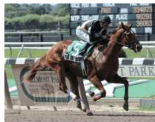
Henny Hughes