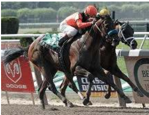
Roman Ruler & Flower Alley

Roman Ruler, who captured the GI Dwyer S. Monday, adds another dimension. He is out of Silvery Swan, a mare whose sire Silver Deputy is by Deputy Minister (a Northern Dancer grandson) out of a mare by Mr. Prospector. This means Roman Ruler has Mr. Prospector 2x4 and Northern Dancer 4x5, with Fusaichi Pegasus being a reverse Mr. Prospector/Northern Dancer cross to Silver Deputy.