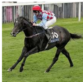
Red Clubs Action Plus

Red Clubs (Ire) (Red Ransom) represents the form of the G2 Coventry S. in this renewal of the G2 July S. at Newmarket. Entering that Royal Ascot at York test June 14 off an impressive conditions score over six furlongs of the Rowley Mile May 25, he duly saw off a host of well-touted rivals. But he races with a subsequent five-pound penalty, and since 1990 only two winners had defied a three-pound extra burden.