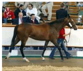
Lot 81