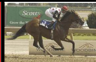
LEMON MAID

SHORT CIRCUIT - 2nd $100,000 Tremont S. 1 Win, 1 Stakes Placing in 3 Starts