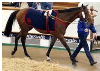
Back to Paris www.tattersalls.com

PARIS RULES IN NEWMARKET Just minutes before London beat the French capital to land the 2012 Olympic Games, some 60 miles north of the venue Back to Paris (Ire) (Lil's Boy) topped day two of