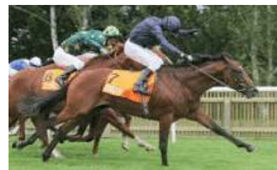
Ivan Denisovich Getty Images

Gamut Tops in Princess of Wales's S.....p2 'Superlative' 2yos Line up at Newmarket.....p5