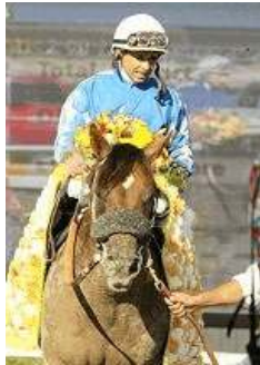
2004 Gold Cup hero Total Impact