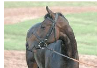
Ouija Board Horsephoto