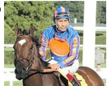
Sense of Style