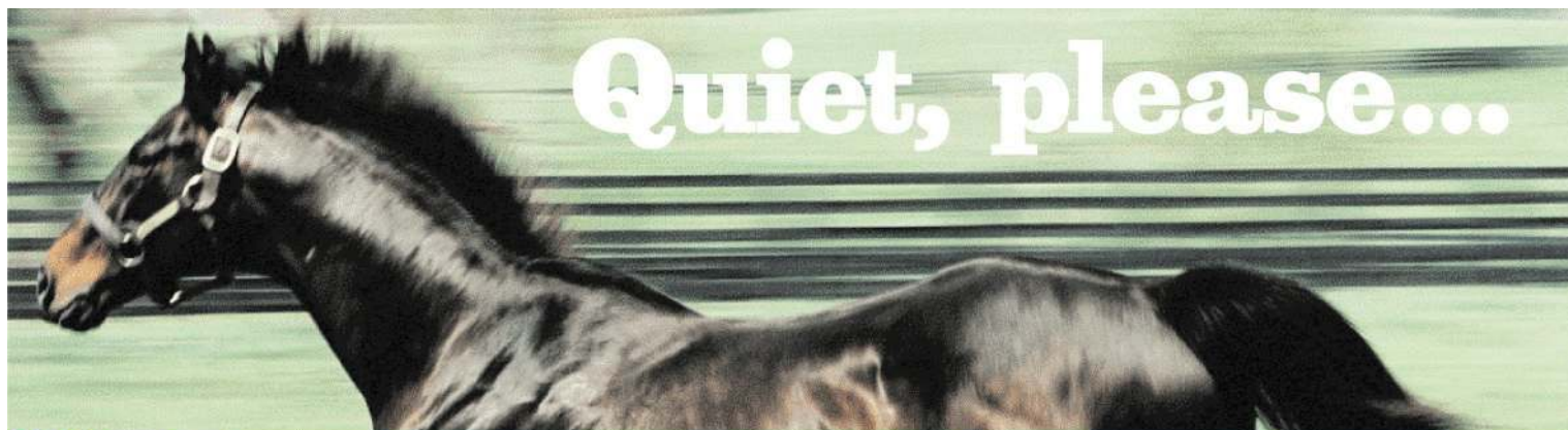
Quiet American Sire of five 2005 Stakes horses, including G1 filly Andujar and Stakes winners Naughty New Yorker and Bright Abundance.