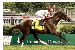
Kitten's Joy