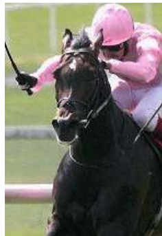
Scorpion