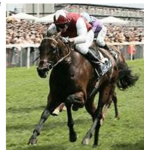
Plea Bargain