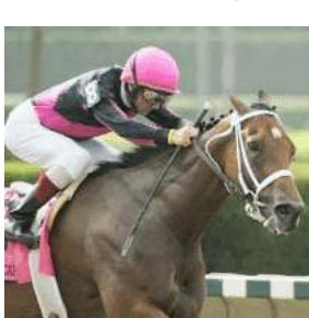
Madcap Escapade

Madcap Escapade (Hennessy), winner of last Sunday's six-furlong GII Princess Rooney H. at Calder, may pursue longer distances in the future, according to