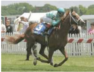
English Channel Horsephotos