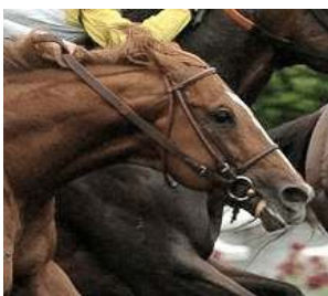
Relaxed Gesture