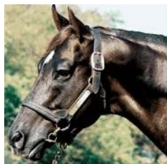
Mr. Greeley Sire of Sires