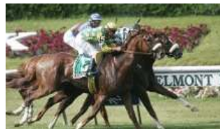
Rey de Café (inside shadow roll) wins a wild Hill Prince A Coglianese